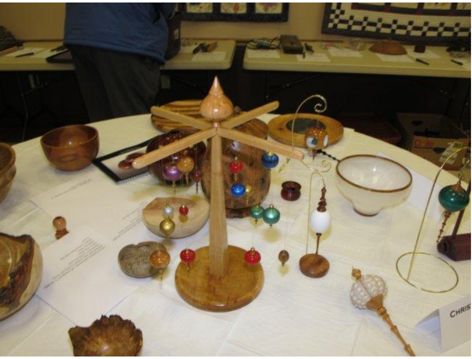
We also had a wonderful show and tell session, with participation by Steve Leichner (elm goblin bowl and maple burl natural edge bowl),