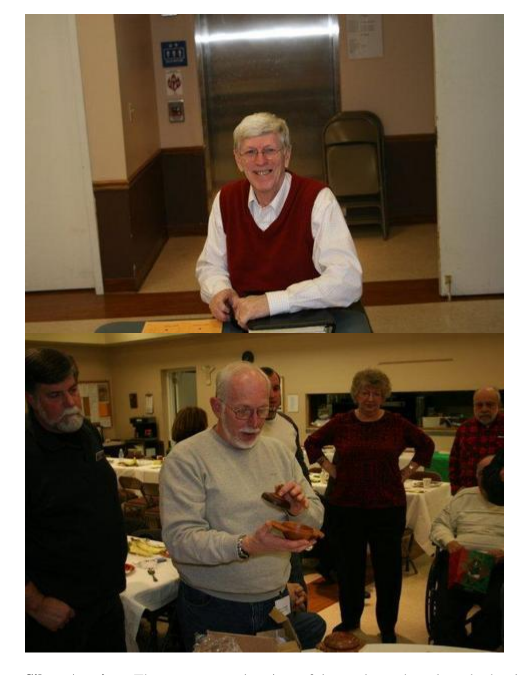
<u>Silent Auction</u> There was a good variety of donated wood, tools and other items to bid on, which generated a lot of interest and raised over $200 for the club treasury. Thanks to everyone who participated.