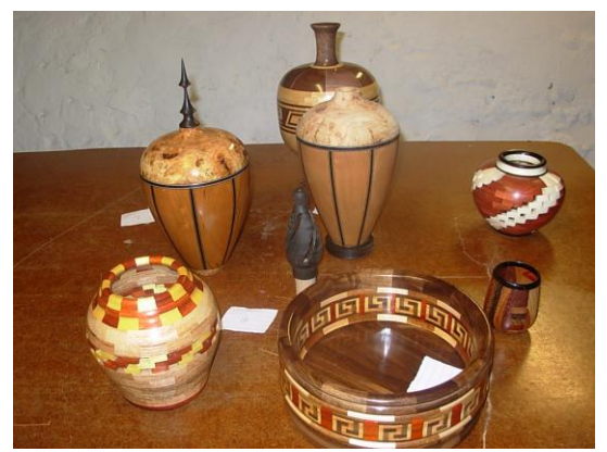
The winner of the $25 prize was Seth Chamberlain, with a very nice open segmented piece constructed of bloodwood, holly and ebony. Good job Seth !!!

The club challenge for January was a segmented piece, of at least 3 layers. Two layers should have at least 6 segments, and a minimum of two different woods should be used.